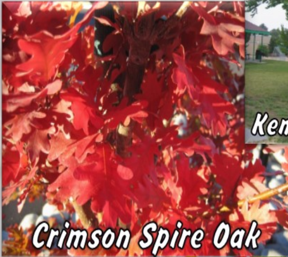
Crimson Spire Oak